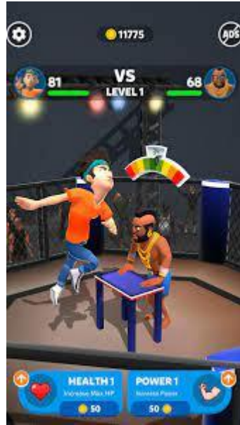
Slap king - For slapping part