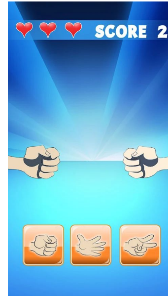
Rock, Paper Scissor - For minigame part